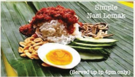
Simple Nasi Lemak